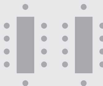
18-20 people standing